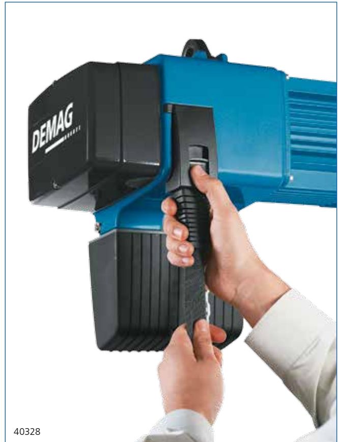
Control pendant height adjustment